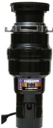
1/2 HP ECONOMY