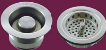
SINK FLANGE / STOPPER / STRAINER SET